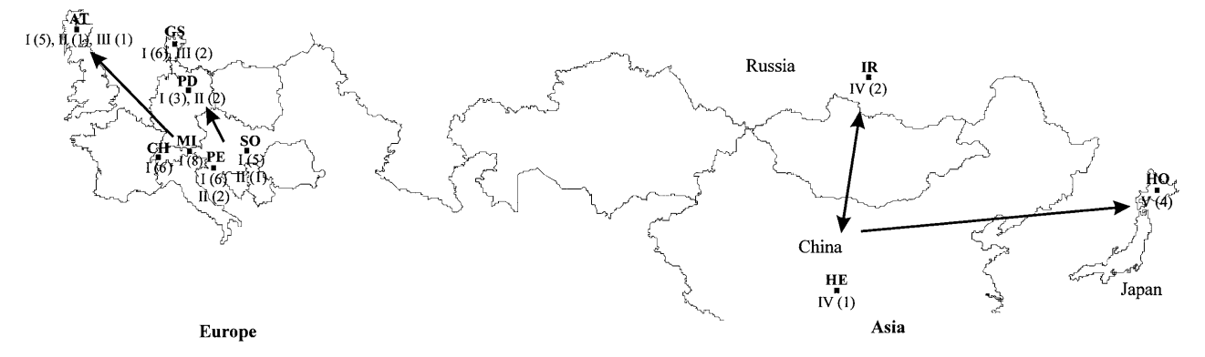
Fig. 1. Distribution of the European haplotypes. Below the abbreviations of the collection sites (see Table 2), haplotypes are given in Roman numbers (I, II, III). Number of individuals sequenced is given in parenthesis besides

Eight fungal taxa are associated with I. cembrae in central Europe (Table 5). These include Ceratocystiopsis minuta (Siemaszko) Upadhyay & Kendrick, an unidentified Ceratocystiopsis sp., Ceratocystis laricicola Redfern & Minter, Ophiostoma bicolor Davidson & Wells, O. brunneo-ciliatum Mathiesen-Käärik, O. piceae (Münch) H. & P. Sydow, an unidentified Ophiostoma sp. and an